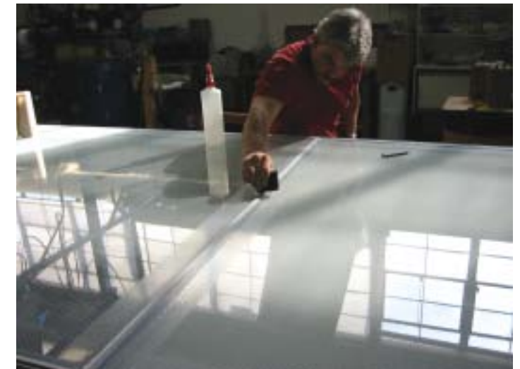
RIGHT Permasteelisa fabricated the wall system at their Windsor, CT plant.

The success of the Ambulatory Care and Education Facility is visible in its dramatically elegant glass curtain wall system. Combining innovative design and engineering, the faceted facade marks a new direction for healthcare design. The prismatic volume sidesteps any institutional connotation, providing a comfortable and inspiring atmosphere for those who use the facility and for those who experience it from the street as an everyday part of their neighborhood.