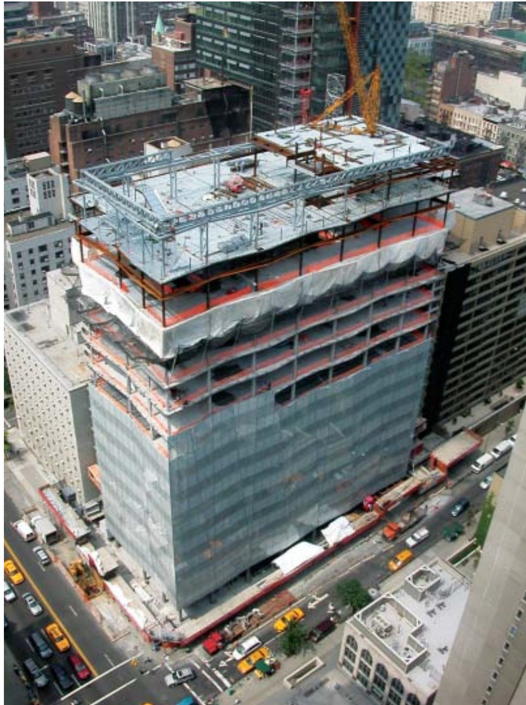
ALL THIS PAGE The panelized wall system combines vision and spandrel lites in one piece for a more efficient erection. Steel at the floor slab edge was carefully calibrated to match the curtain wall's folds.

upper floors, but also eliminated the pillowing effect that mars many glass walls. It also helped to achieve a flat face, creating strikingly undistorted reflections.