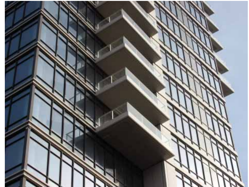
Facing One Northside Piers as seen from the public pier nearby.