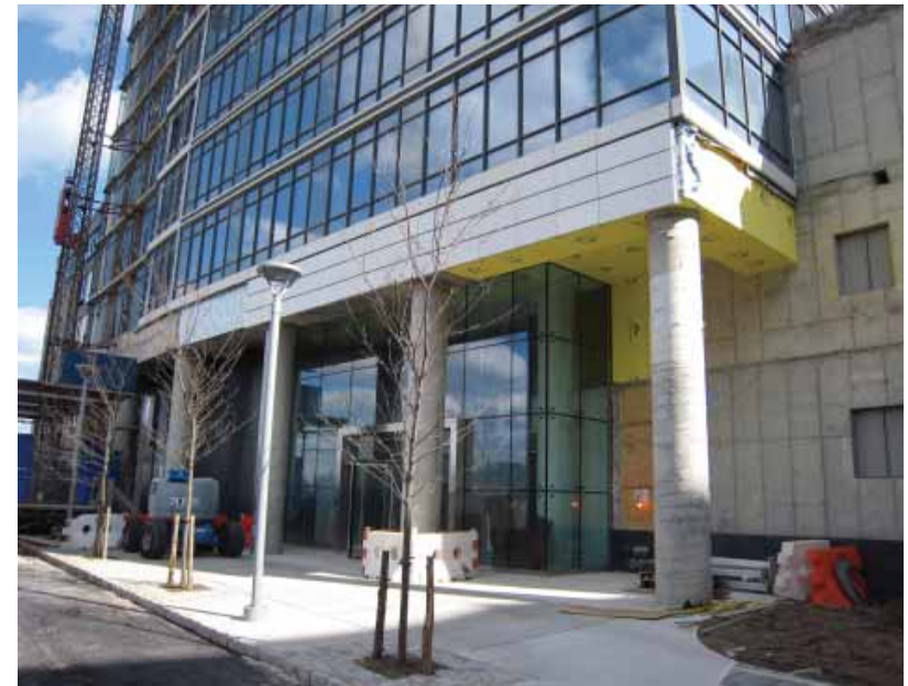
Facing, left The Type A slab cover; Facing, right The Type B slab cover

Above Working with the fabricator to create window units with integrated slab covers allowed architects to create a more complex window wall system.